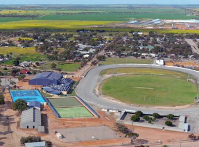
View over Kellerberrin township

With a range of accommodation options, Kellerberrin is a great spot to stop for the night before continuing your Eastern Wheatbelt adventure along the Granite Way toward Bruce Rock. The Granite Way is a 60km self-drive trail that takes visitors to some of the most impressive granite rocks in the Wheatbelt including Mount Caroline (see #9 at map ref D6) and Mount Stirling (see southern #9 at map ref D6), both of which are located approximately 20km south of Kellerberrin.