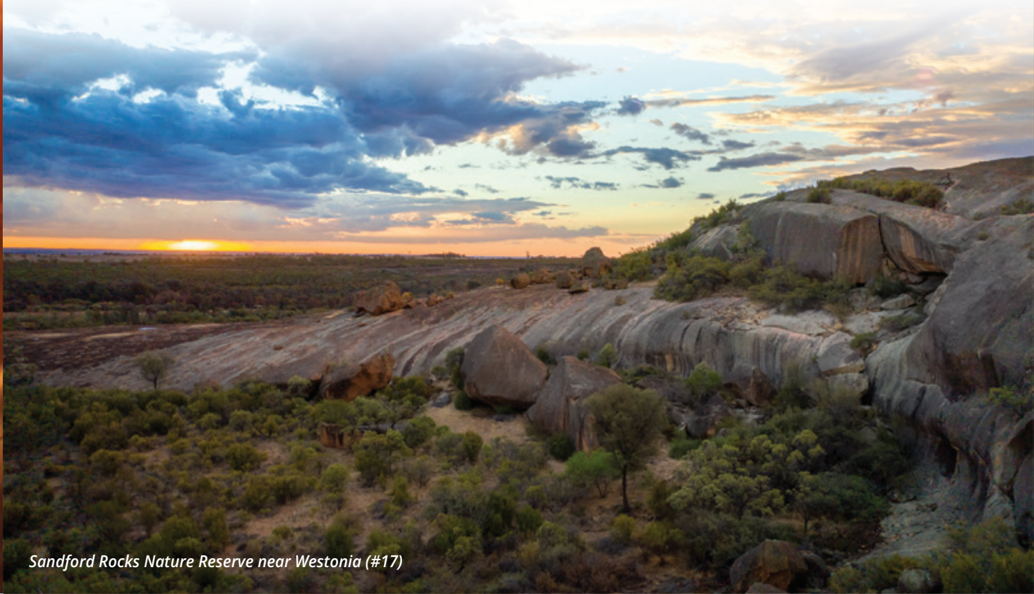
Sandford Rocks Nature Reserve near Westonia (#17)

Accommodation: Bed & breakfasts, self-contained units, farm stays, motels, hotels, caravan parks, RV-friendly towns and free camp sites.