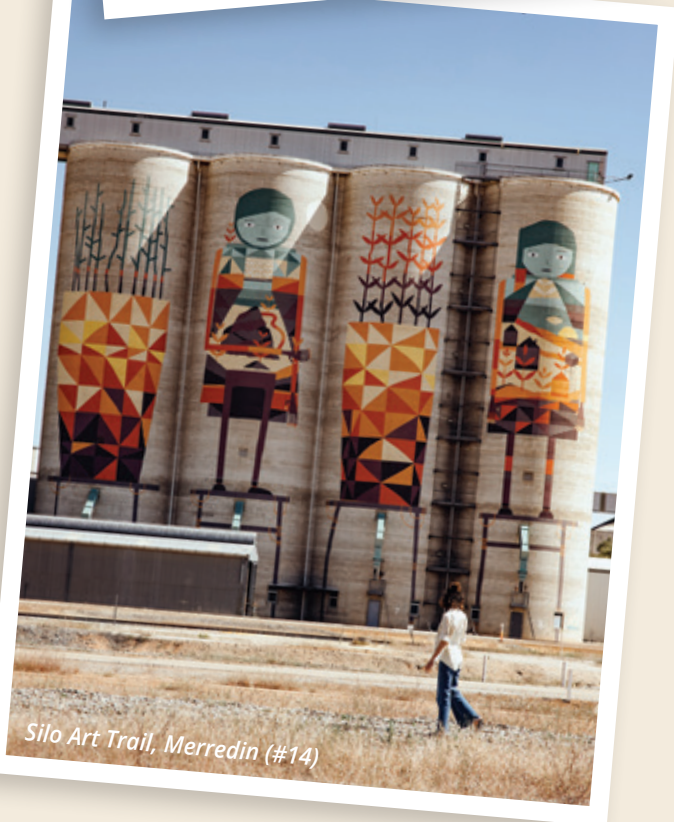
Silo Art Trail, Merredin (#14)

#16 at map ref I4), showcases early life in the shire, including a mine tunnel and blast simulation. The Edna May Mine Lookout , located 1km north of town, offers views over a working gold mine. Continue your drive approximately 10km north of town and you will find Sandford Rocks Nature Reserve (see #17 at map ref I3). Experience the granite outcrop, wildflowers scrub and woodland, this area is a must do for bird and wildflower enthusiasts.