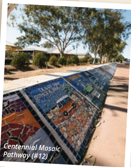
Centennial Mosaic Pathway (#12)