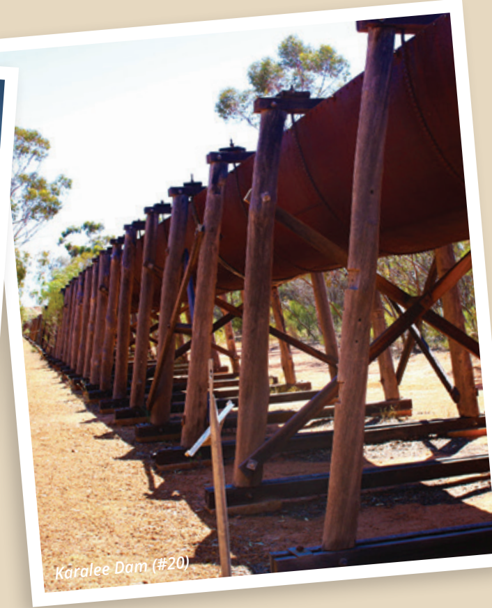
Karalee Dam (#20)

a glimpse of the rich history of the area.