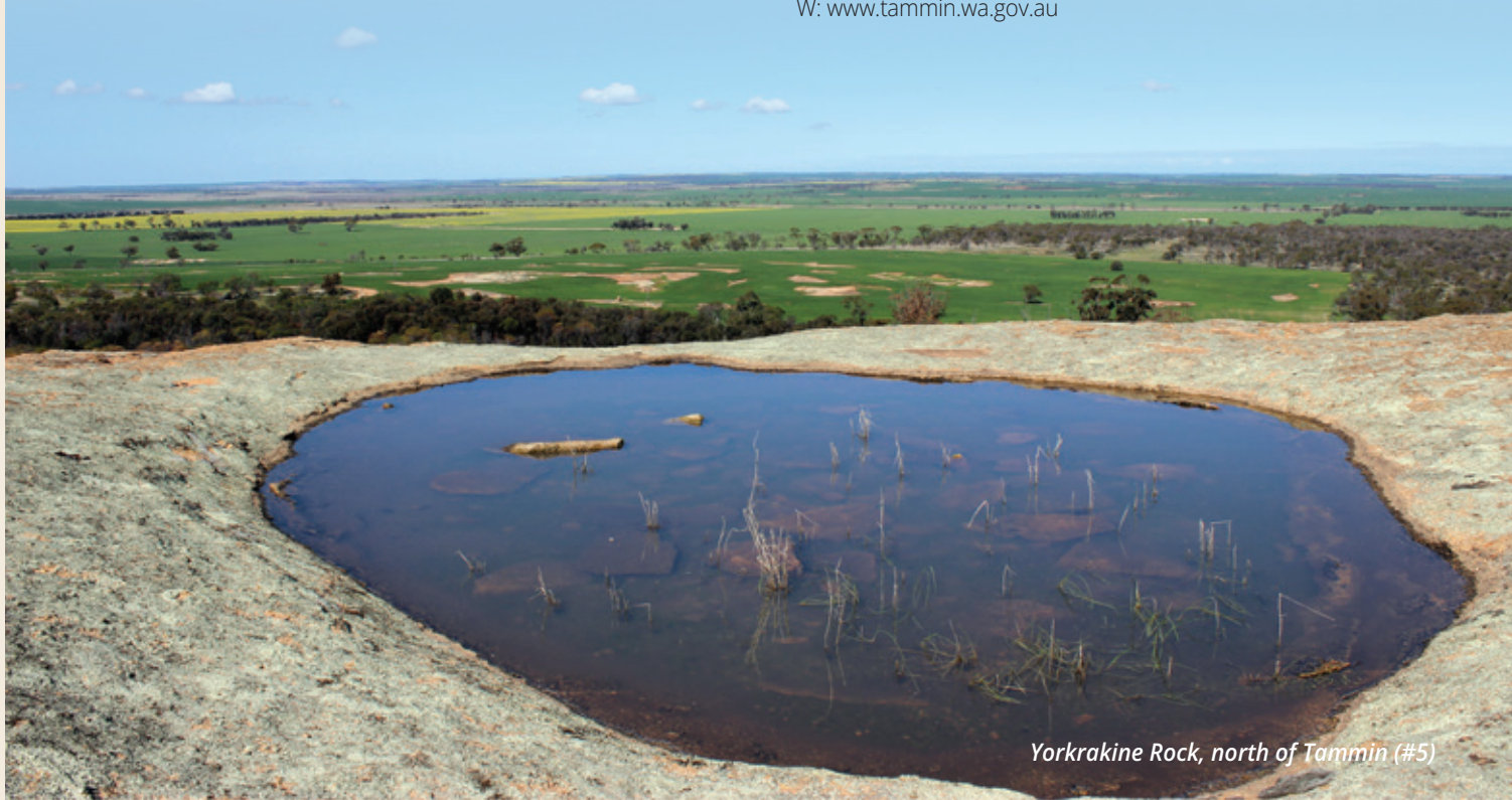
Yorkkrakine Rock, north of Tammin (#5)

From town travel 26km North to Yorkkrakine Rock, a solid granite outcrop surrounded by native flora. Follow the walk trail up and over the rock where you'll find gnamma holes, pockets of vegetation, and sweeping views of the surrounding landscape.