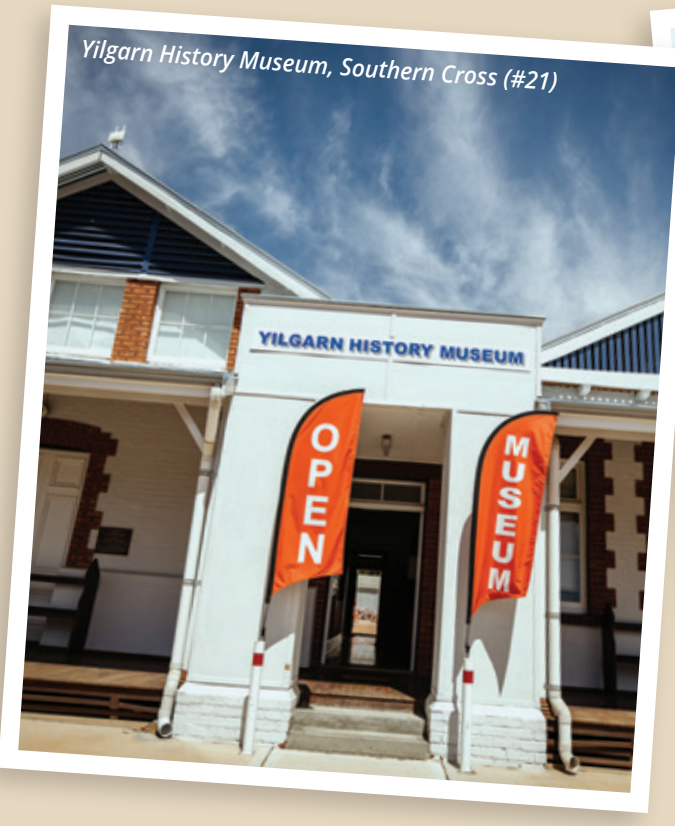
Yilgarn History Museum, Southern Cross (#21)

Start the next day early with a drive 34km south of town to Frog Rock Nature Reserve (see #19 at map ref K5). Here you will find beautiful wildflowers in the spring with a wave-like rock formation and dam at the base of the rock. From Frog Rock you can make the journey back to Southern Cross and take in the Yilgarn History Museum (see #21 at map ref K4) open daily, for