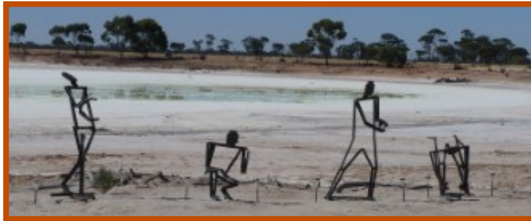
1. Sculptures in the Salt Lakes is located 5km west of Kondinin on the Corrigin-Kondinin Rd.