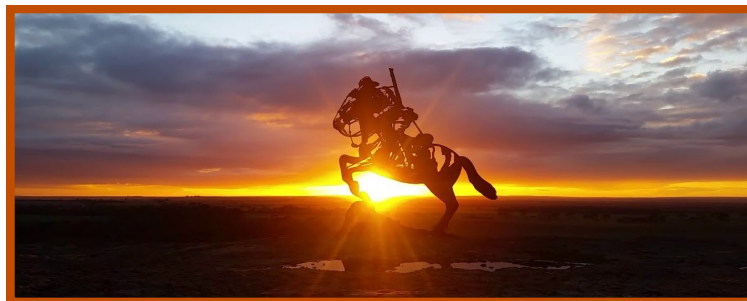
15. The Light Horseman Statue is located at Yeerakine Rock on Sloan Road. Head east from Kondinin on the Kondinin-Hyden Rd (2.6km) and turn right on to Sloan Rd. After 6.8km on Sloan Rd, turn left into the Yeerakine Rock Car Park and then take the walk path to the summit of the rock.