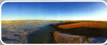
Lake Brown