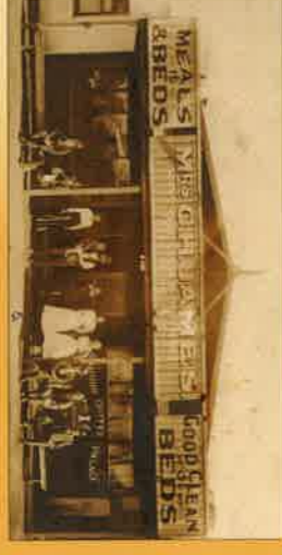
James' Coffee Palace, Westonia 1916