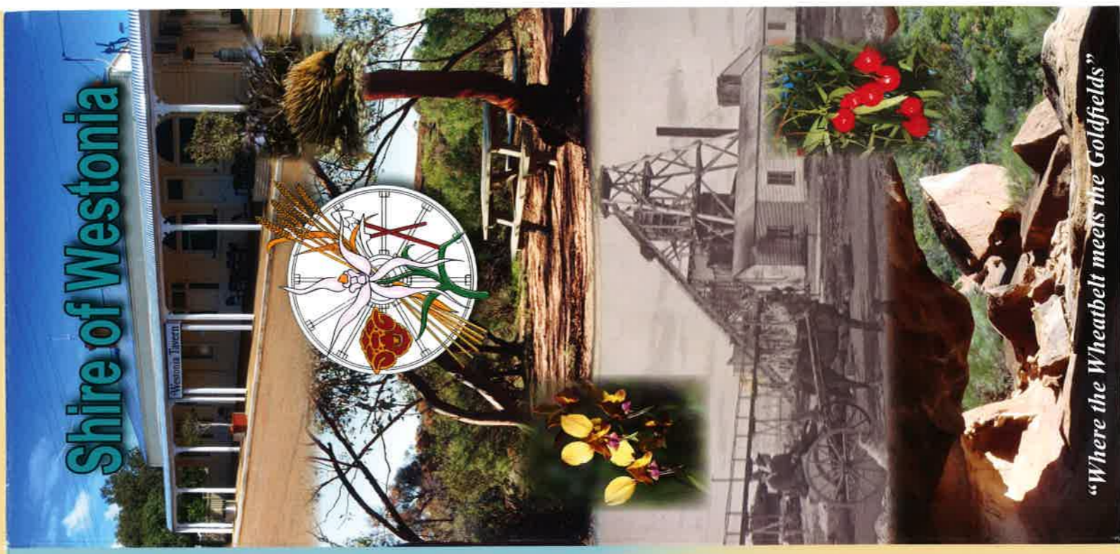
"Where the Wheatbelt meets the Goldfields"

Entry to the Hood-Penn Museum is $3 for adults and $1 for anyone under the age of 18. The Hood-Penn Museum features a variety of scenes showcasing early life in the shire including a pub, a shop/hardware store, a petrol station/garage, a kitchen, a bedroom and a blacksmith/farm workshop. A vibrating interactive mine tunnel exhibit is also included within the museum that gives visitors an idea of what life in an early Westonian gold mine would have been like. The museum is open Monday to Friday 9.00 am to 4.30 pm and entry is via the shire office on the main street. Cameras and walkies can be taken into the museum but handbags must be locked in a locker in the shire office foyer.