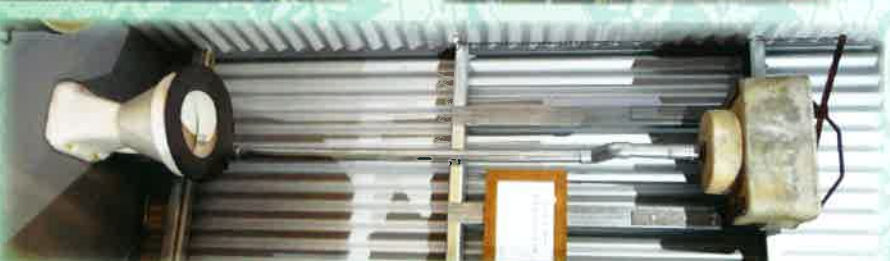
Old pull the chain toilet