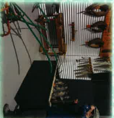
Blacksmith / Farm workshop scene