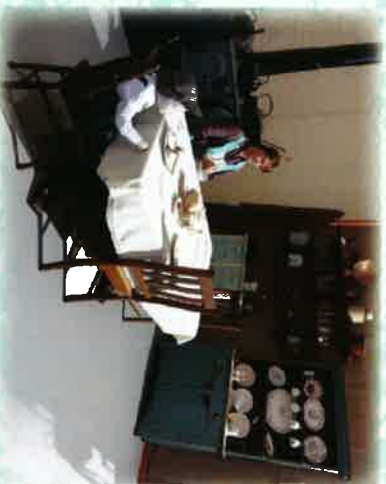
Farm kitchen scene