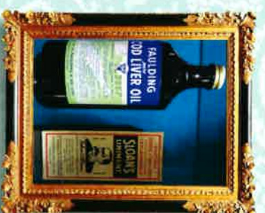
Historic remedies & potions