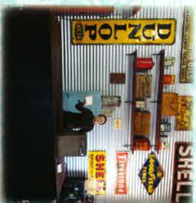
Petrol station / Garage scene