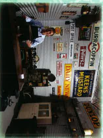
Shop / Hardware store scene