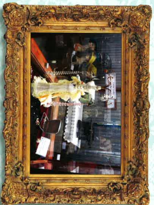
Costume jewellery display

Entry is $3 for adults & $1 for anyone under the age of 18. Please note that nothing larger than a camera or a wallet can be taken into the museum. Lockers are available in the shire office foyer for secure storage of handbags.