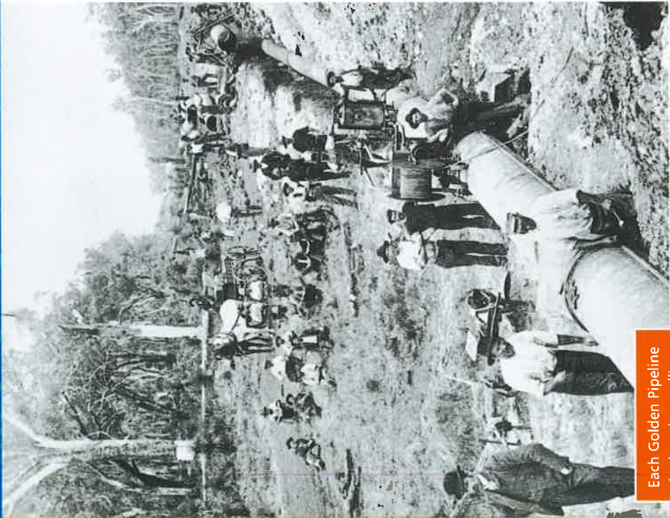
Each Golden Pipeline site has signs telling its story. Parking is provided and some sites have self-guided walk trails.