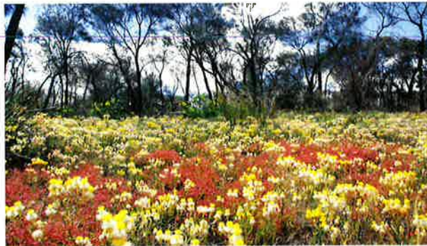
Wildflowers from September to October at Yeerakine Rock.