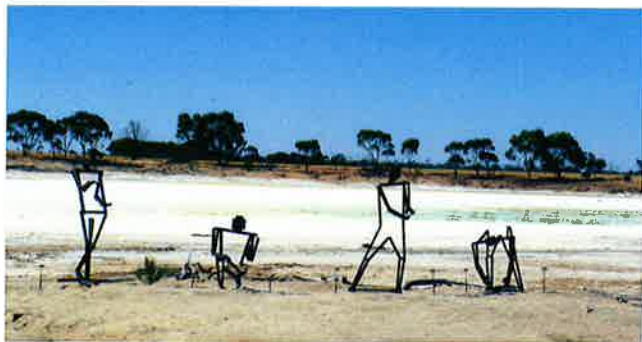
The 2012 winning sculpture 'Waiting for Hay to Dry' set on a local green salt lake.

Opening night is on a Friday evening and the Art show remains open for 4 days.