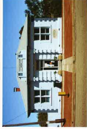
The historic Railway Station