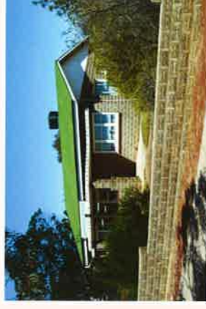
Original CWA Building