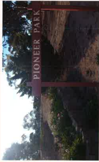
Pioneer Memorial Park, take time to stop and smell the roses.

Driving through the Town one can view fine examples of buildings dating from the early 1900s. Among these are National Trust and Heritage listed buildings such as the Methodist and Catholic churches, Masonic Lodge, Lady Novar Hostel, Railway Station, Museum House and the Agricultural Museum.