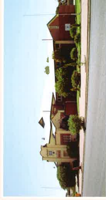
Wyalkatchem Town Hall